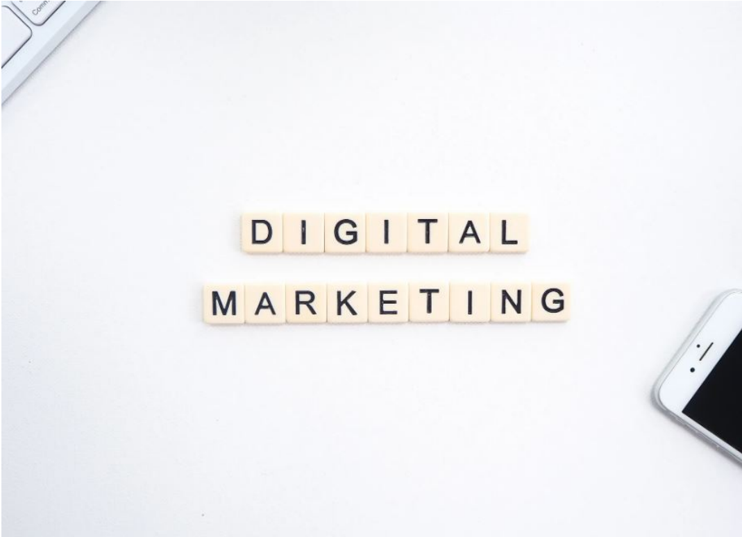
The Main Principles Of

Sharing is caring!Digital Marketing" is among those terms with which we all have a feeling that we know what is implies, however when it concerns nailing it down we somehow get stuck. In the end, it is not clear which kinds of digital marketing we are speaking about.